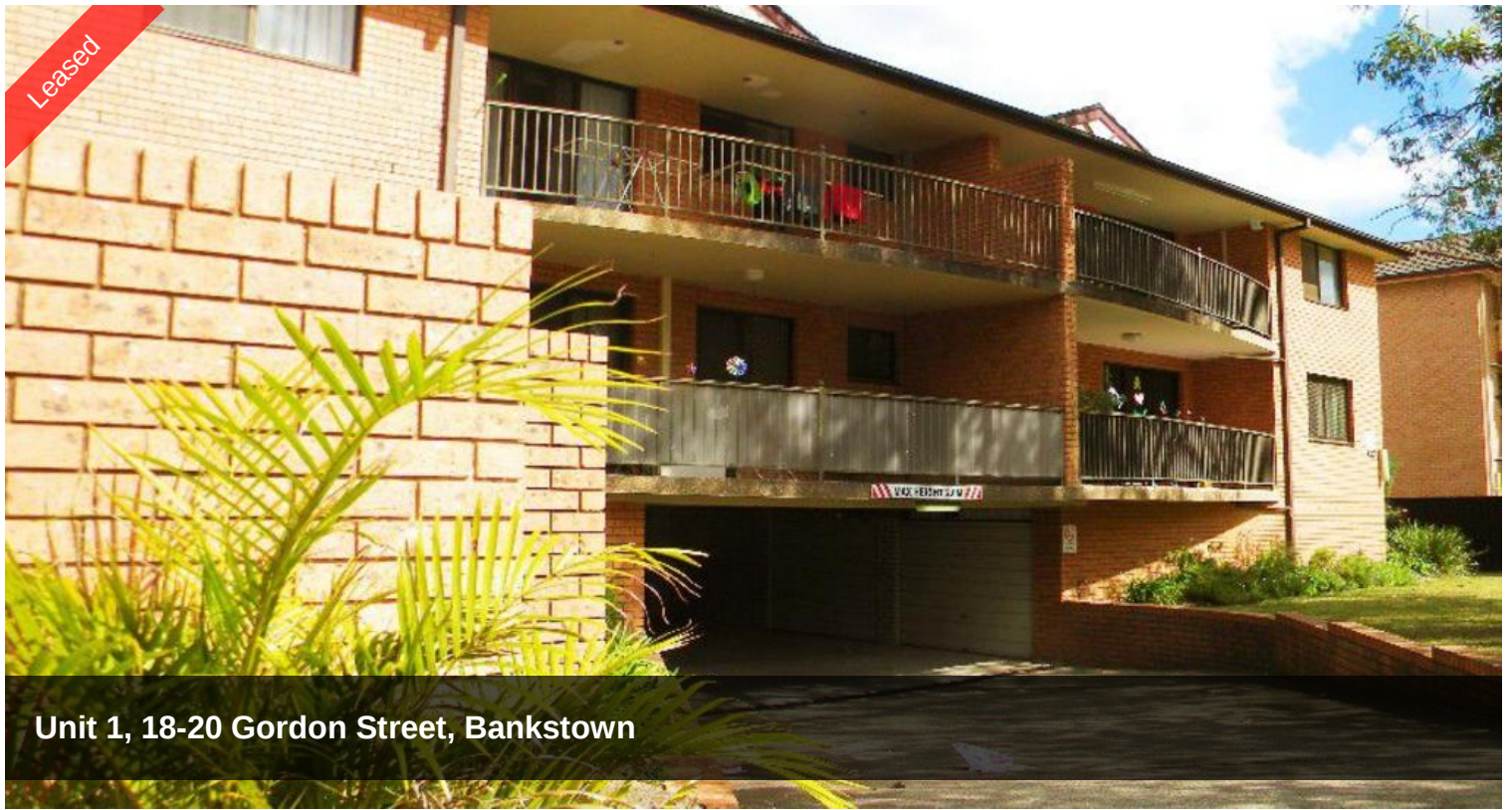
Unit 1, 18-20 Gordon Street, Bankstown