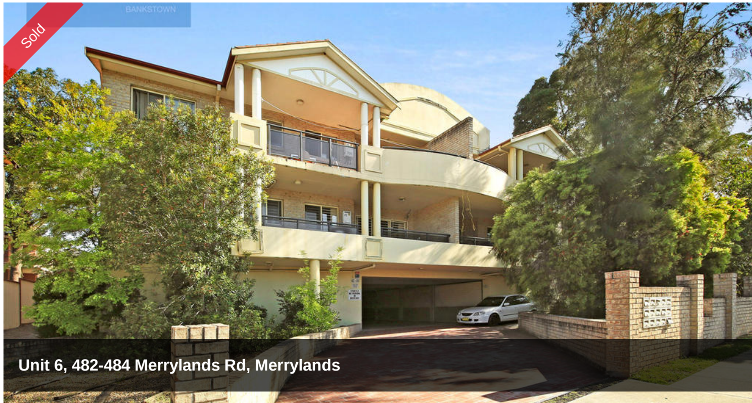
Unit 6, 482-484 Merrylands Rd, Merrylands