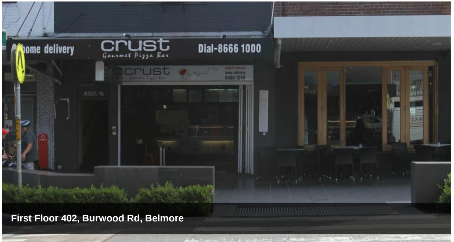
First Floor 402, Burwood Rd, Belmore