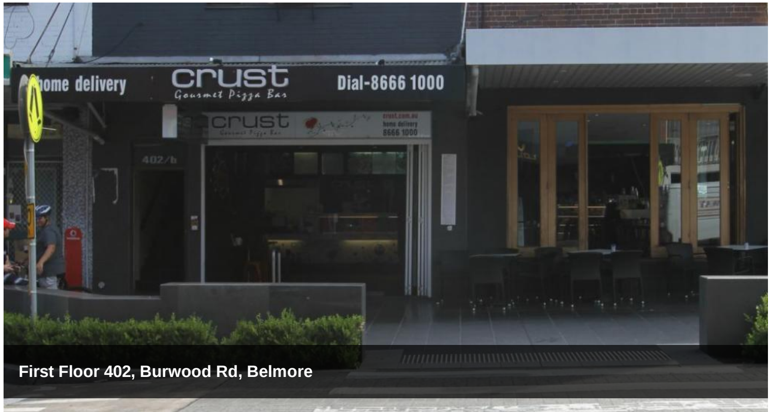
First Floor 402, Burwood Rd, Belmore