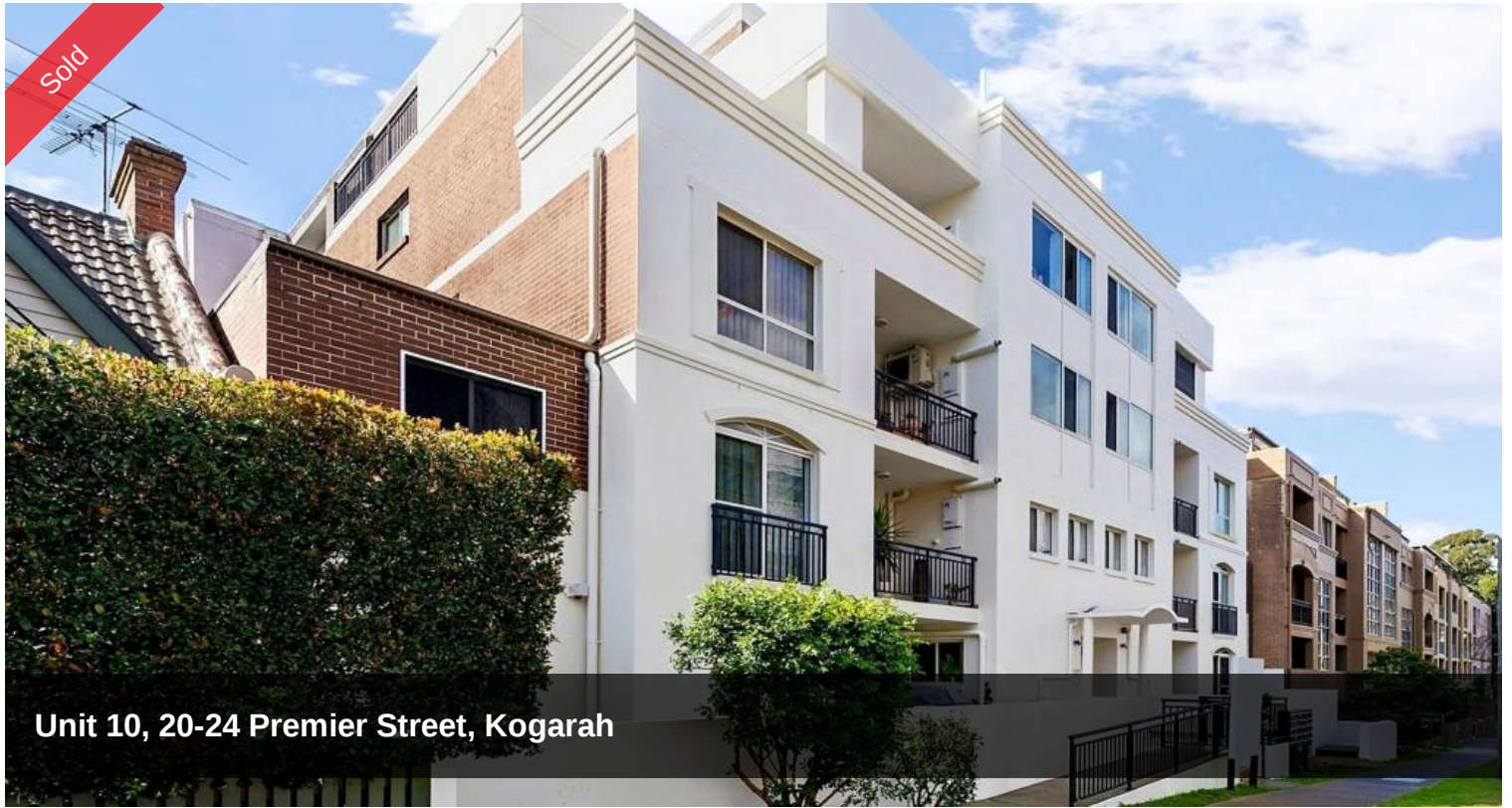
Unit 10, 20-24 Premier Street, Kogarah