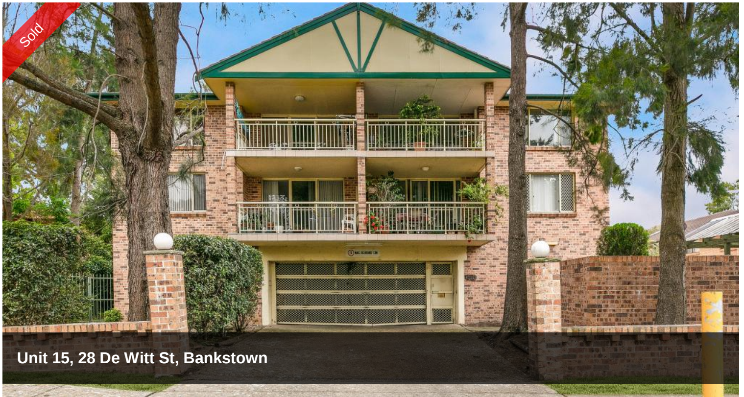
Unit 15, 28 De Witt St, Bankstown