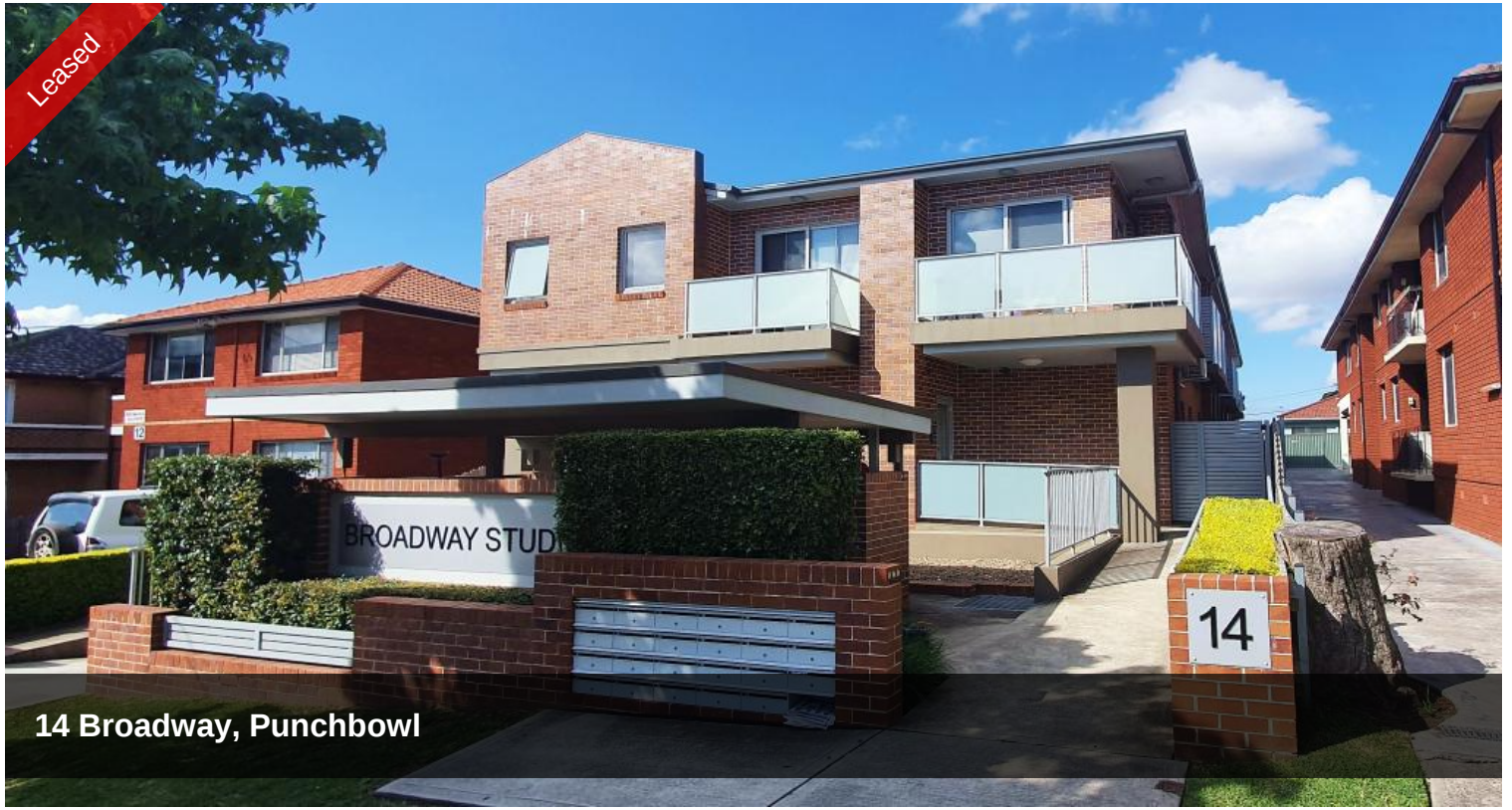
14 Broadway, Punchbowl