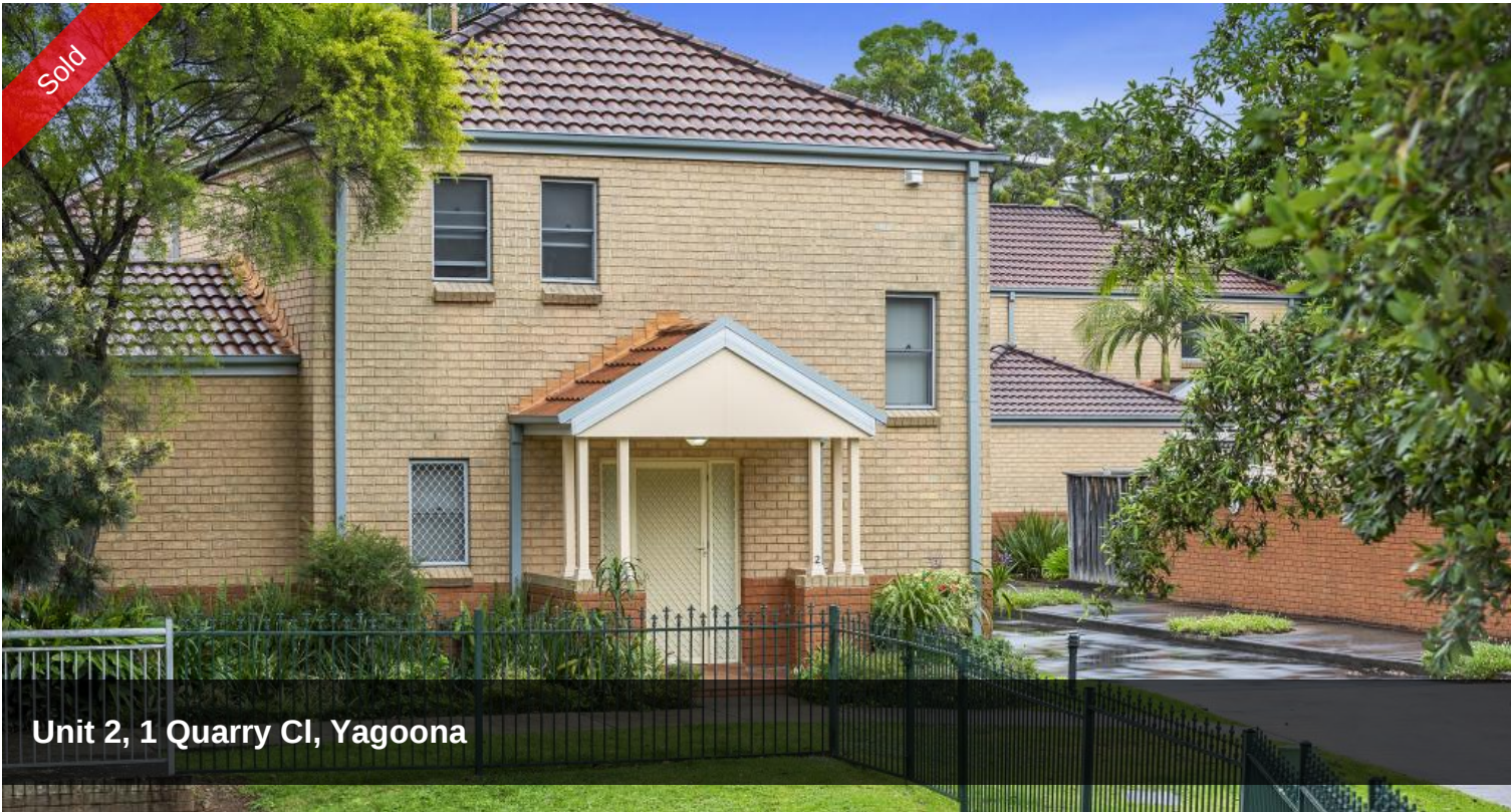
Unit 2, 1 Quarry Cl, Yagoona